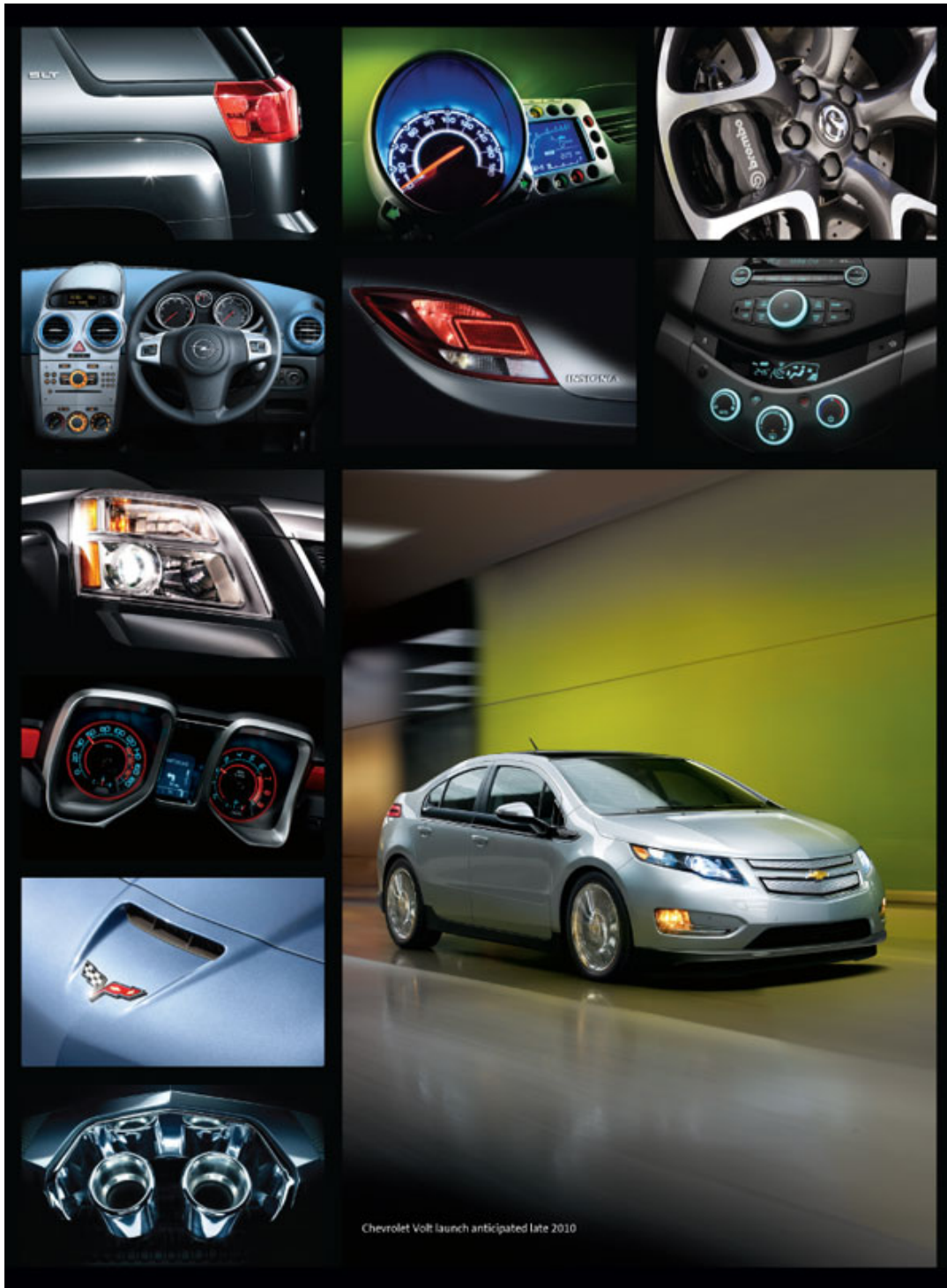
Chevrolet Volt launch anticipated late 2010